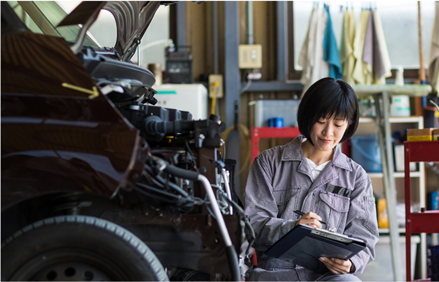
Auto Facts + Statistics: Auto insurance